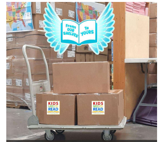
Books for California

“We are so grateful for the book donation. Our patients and families have been thrilled to receive a new book at their visits and work on reading while at the doctor's office. It also helps us reinforce the importance of literacy in our community, especially being a largely bilingual community. We cannot thank you enough for what you're doing and the children you are helping.”