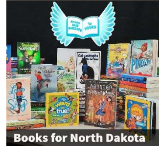
Books for North Dakota