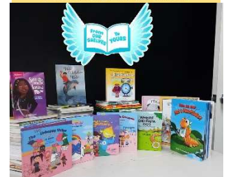
Books for Maryland