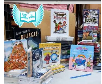
Books for North Carolina