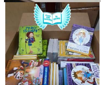
Books for Montana!